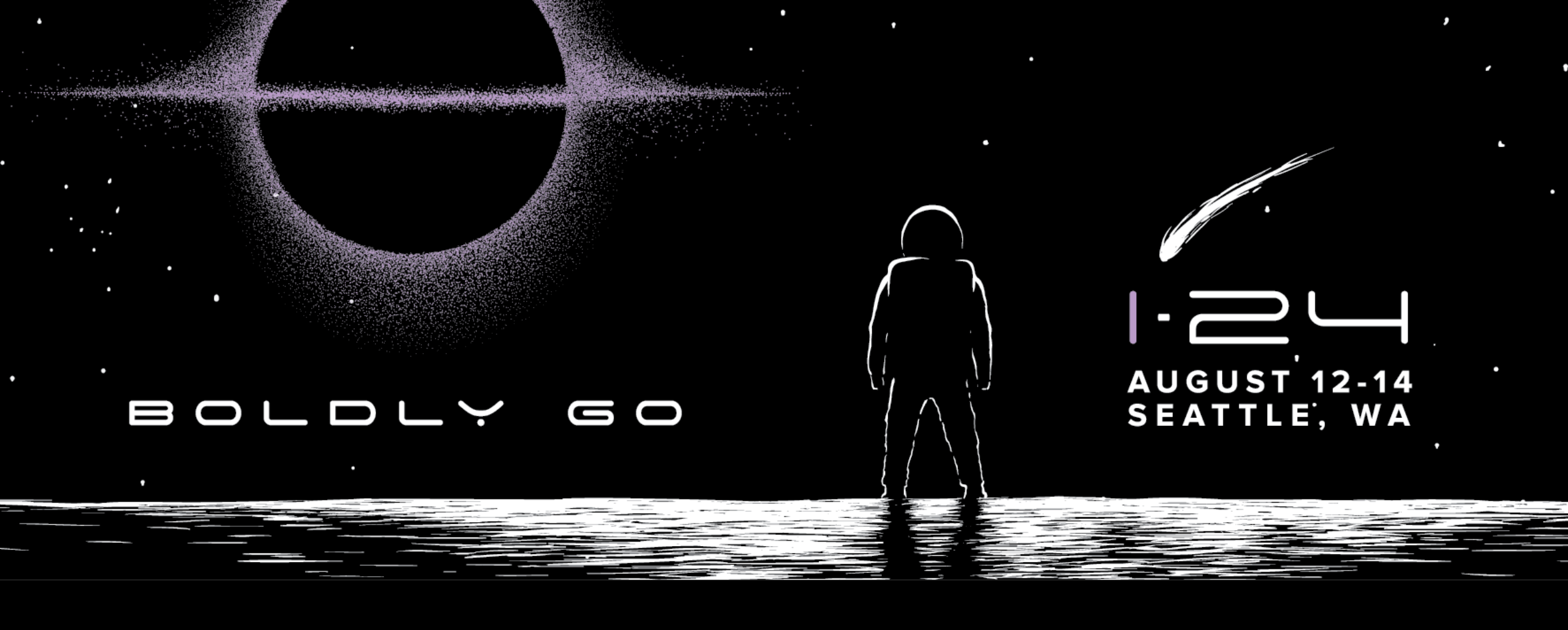
2024 International Flagship Conference